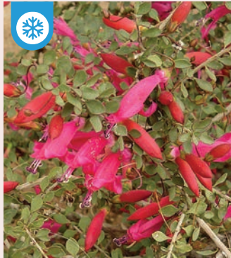
Valentine Emu Bush