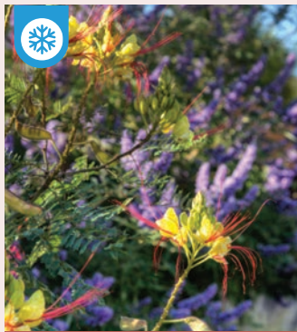
Mexican Bird of Paradise